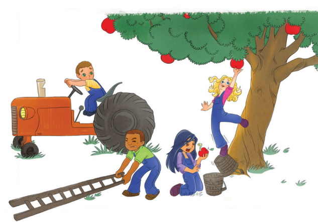
Group plan/own plan illustration.

In the story, the group plan was to pick apples. Evan followed his own plan and pretended to drive a tractor.